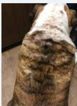
February 5, 2019