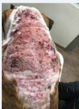
November 15, 2018 Second visit